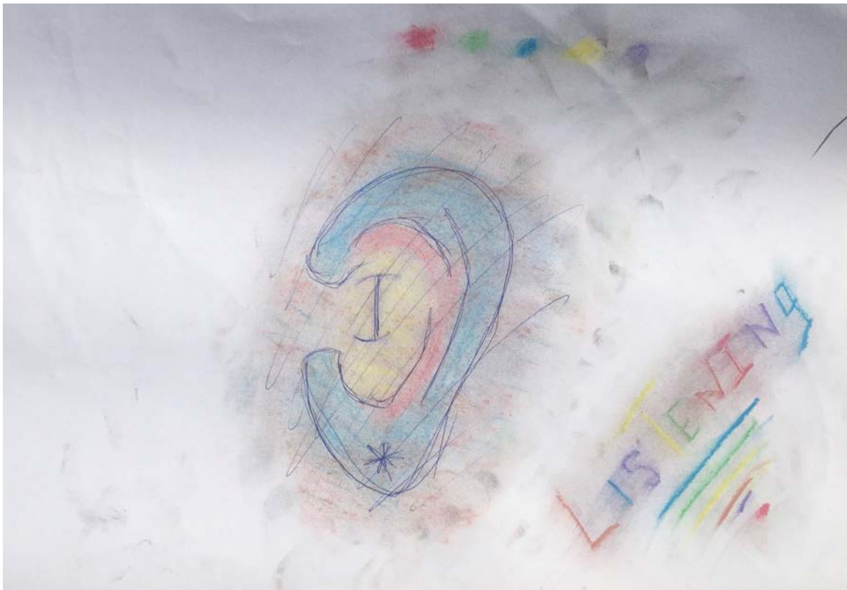
Art work created by a young person who took part in PLAN A

“(PLAN A) made me think in a different perspective about my options, opened up my mind, (gave me) a different way of thinking.”