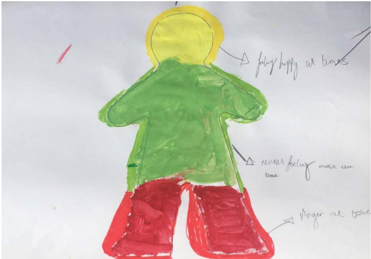
Art work created by a young person who took part in PLAN A